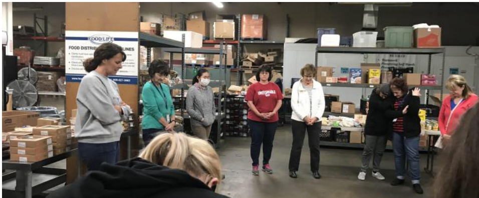
Volunteers praying moments before a distribution.

Our volunteers are the heart and soul of Food for Life Ministry. It doesn't take a lot to be a volunteer—just some time and a heart willing to serve.