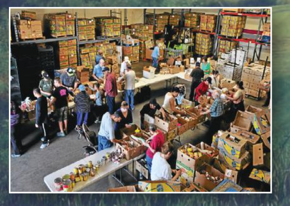
Food for Life Ministry is committed to serving those in need with food and encouragement. Food For Life ministry desires to care for the whole person, providing food for the body and nourishment for the soul.

Food for Life Ministry is looking forward to hosting our sixth Golf Tournament, at 8 AM on October 20, 2023 at El Prado Golf Course. We want to have fun, to promote and raise awareness of Food for Life Ministry, and to raise much needed funds for our organization. We thank you for considering joining us, and hope that you will have a fun day.