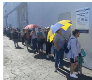
Clients waiting in the hot sun to receive groceries.

As noted above, we have expenses we need to meet. We trust God to provide and are continuing in the mission He has given us to help feed the needy in our valley. Will you partner with us financially? Any amount is gratefully appreciated.